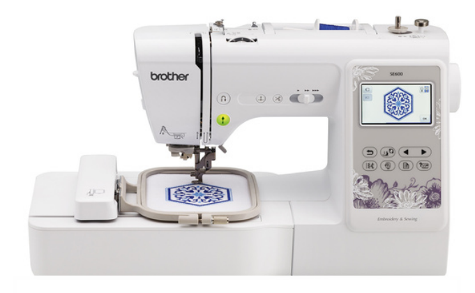
Brother SE600 & SE700

Machines differ by library. To determine availability of a specific machine, contact the makerspace.